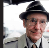
William S. Burroughs