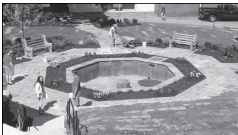
New renovations on Sylvan Pond make it easier to "pond" students on their birthday.

A dedication ceremony was held August 12 at Sylvan Pond.