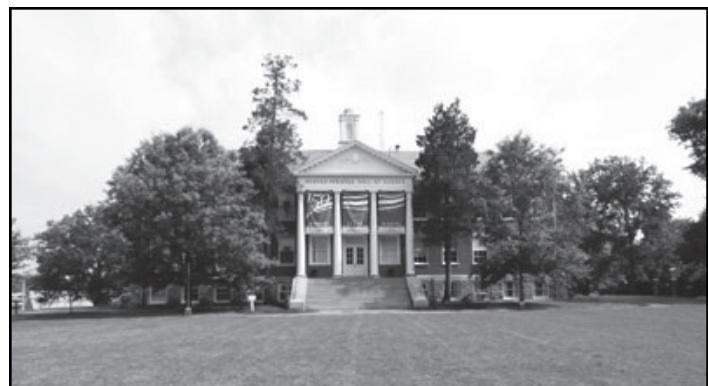
The Science Center as it looks today.

The addition will be four stories high and primarily house the teaching labs. Once the current Science