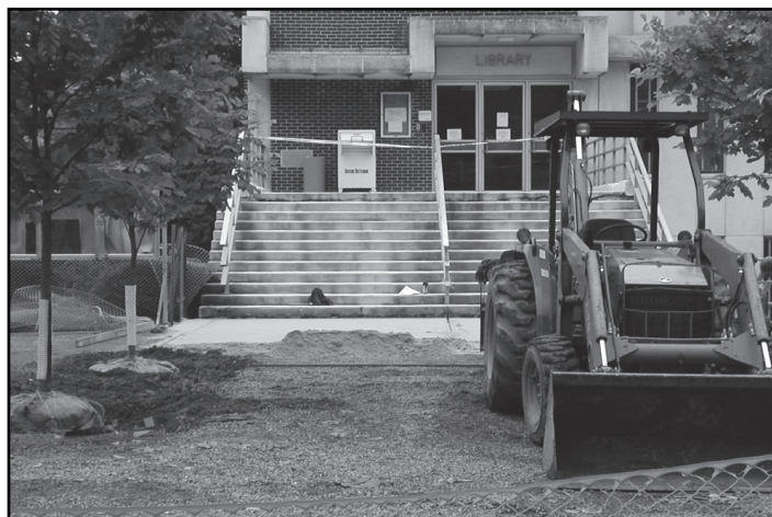
Construction begins on the library plaza.

The plaza area at the steps of Albright's Gingrich Library will soon be a new outdoor