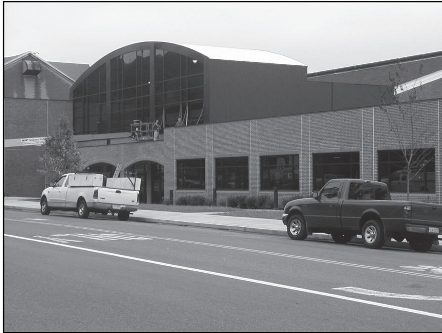
The new Schumo Center is finally open for use.

machines will feature standard headphone jacks which will allow the user to select the audio for their desired programming.