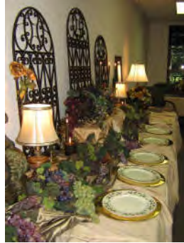
The Da Vinci Room

The first ever DCP offsite event took place last August in Lancaster leaving all who attended in delight. An Evening in Tuscany featured three Italian-themed rooms where food was served, and